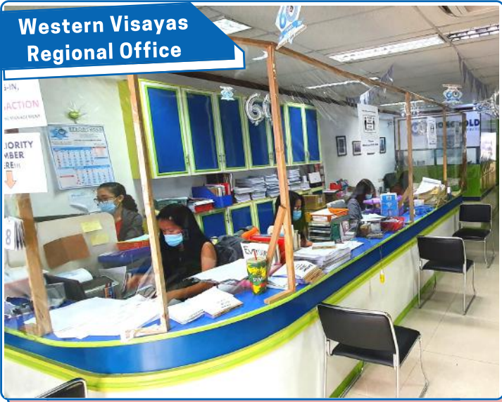
Western Visayas Regional Office