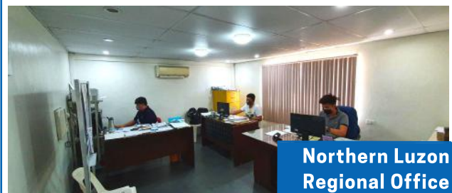
Northern Luzon Regional Office