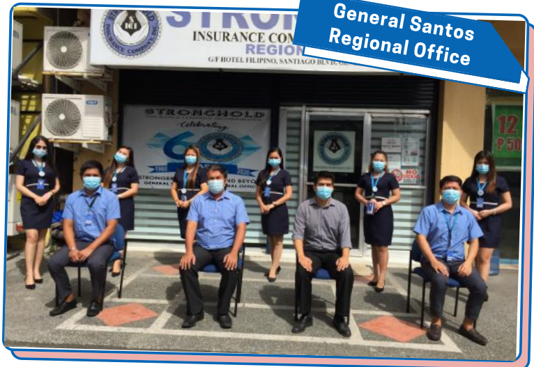
General Santos Regional Office