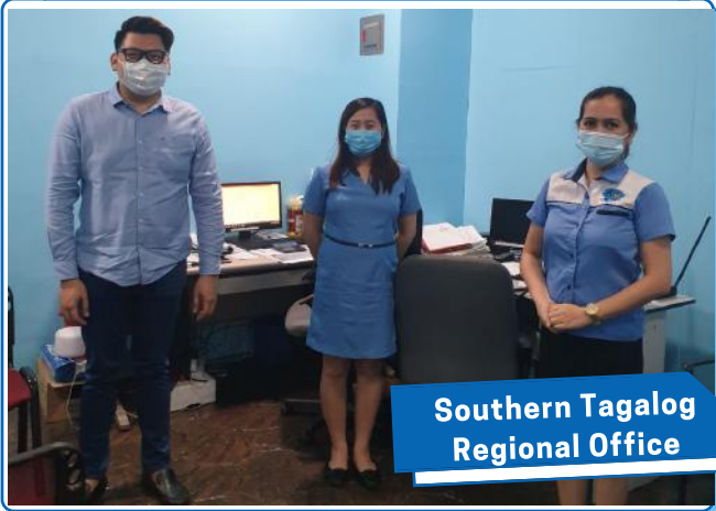
Southern Tagalog Regional Office